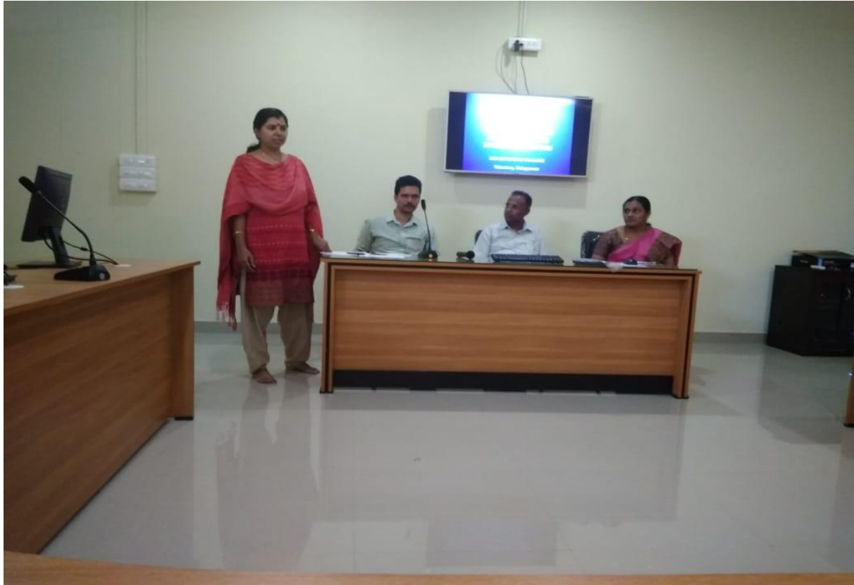
INTERNAL MENTORS MEETING